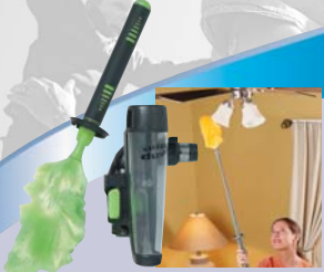
Telescopic Spin Duster 045472