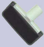
Lint Removal Tool 045166