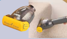
Power Paw with Riser Visor 62550