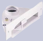
Vacpan™ Available in White, Black and Almond VCPW01C