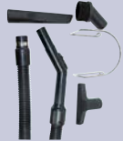
Utility Garage Kit AK55