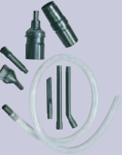
Micro Tool Attachment Set - 061405