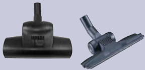
11" Air Driven Powerhead TK280