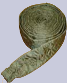
30/35' Quilted Hose Sock 170320/170321