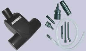
Hand-held Mini Turbo Tool 28A